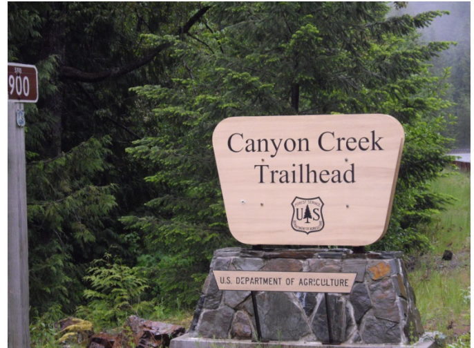
LUNCH STOP – SATURDAY – MP 141.5

Menu: Turkey and PBJ sandwiches, trail mix, cookies, Gatorade, fruit, pretzels, water and soda.