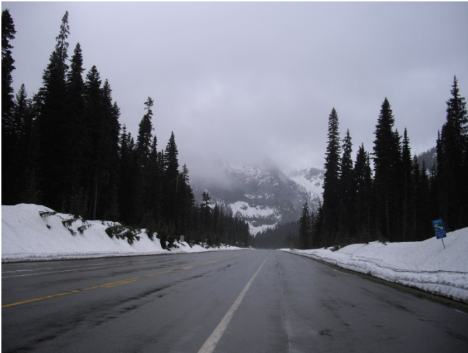
View Eastbound – Washington Pass 6/18/2011

lsputdy@hotmail.com or Janice_letteer@hotmail.com (cell) 206.696.3118 or (cell) 360.269.7510