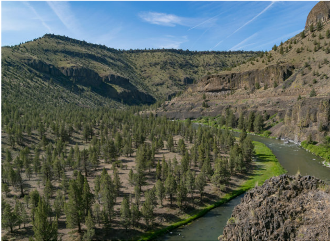
Crooked River Scenic Bikeway

patterns. We've ridden it in December at 53 degrees, but there have been years when we wouldn't want to venture out in the cold and snow. You can always try calling the bike shop ahead of time to get a report.