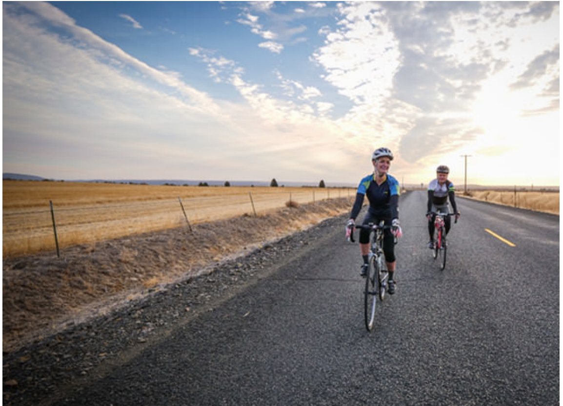
Sherar's Falls Scenic Bikeway

But no matter when you ride this Scenic Bikeway, be sure you pause for a moment at some point and give a little thanks for pavement.